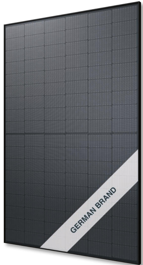
Fig. similar 08MHEN240805A