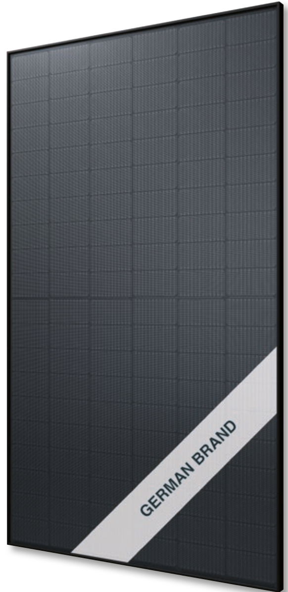
Fig. similar 120MBTUSA240805UAE-153/1