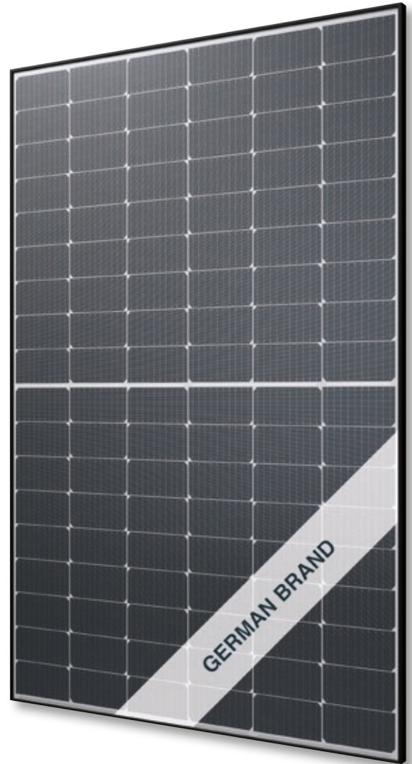
Fig. similar 08MIHEN240805A